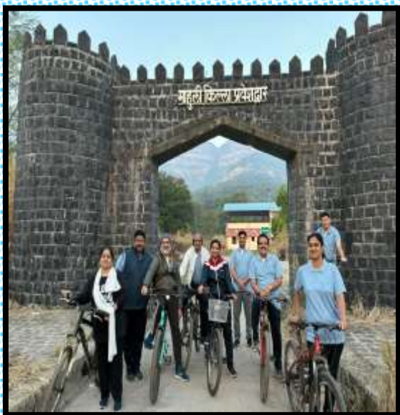
The well-being experience